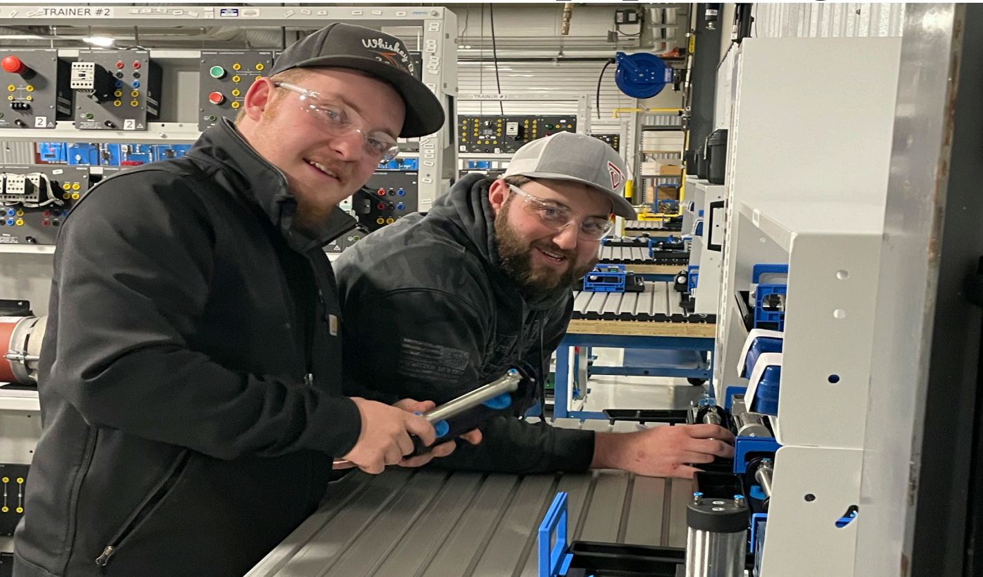
Industrial Maintenance Technician students using grant-funded equipment

BSM Navigate 12:00 pm - 12:45 pm Baptist Student Ministry building