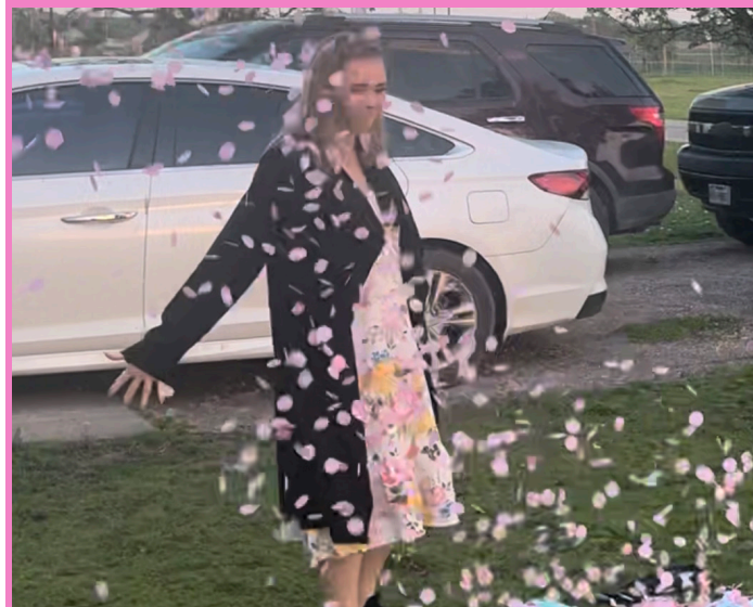
Surprise! It's a girl.