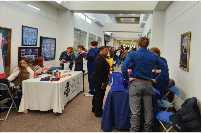
The Spring 2023 Health Science Job Fair hosted by the Career Center and the Center for Workplace Learning was rated a 5-Star event.