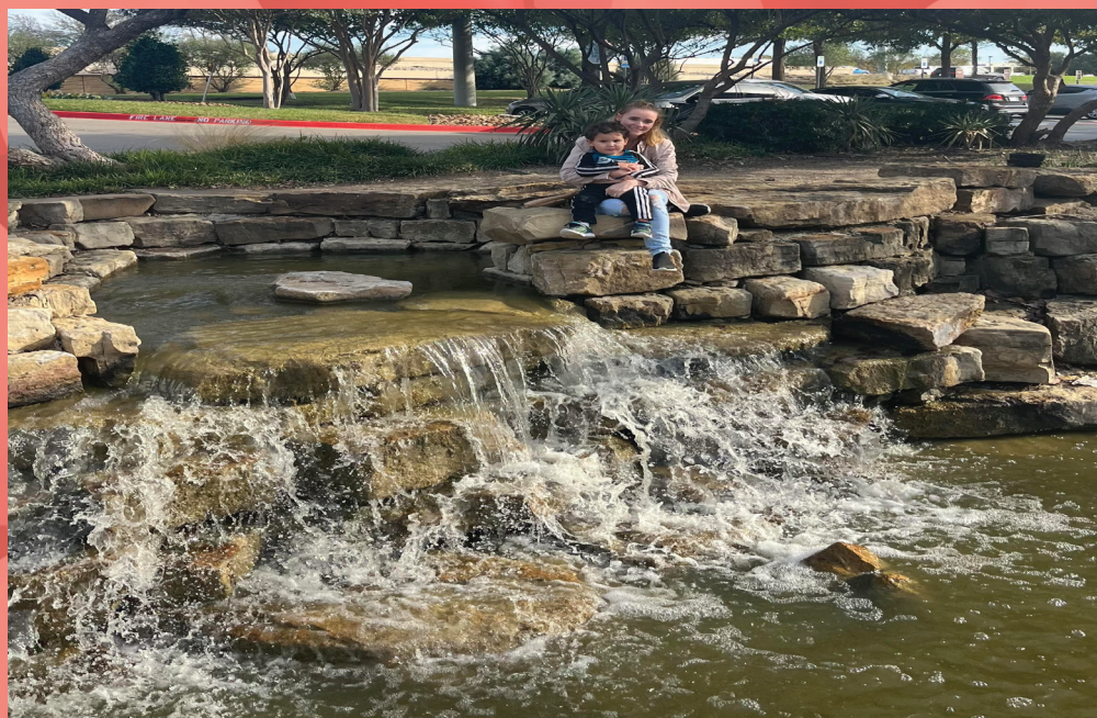
My son and I after getting lunch and Cheesecake Factory in Watters Creek, Allen Texas. This is a beautiful spot for a date, or nice lunch.