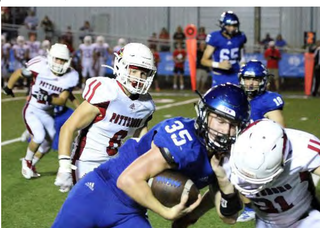
Gunter Tigers v. Pottsboro Cardinals 2019 season game. Represents the risks that we take playing sports.

The concussion protocol at the time consisted of asking the player to memorize two similar words and two random ones, and then they would have to recall what the words were after a certain period of time. He couldn't remember, so their trainer diagnosed him with