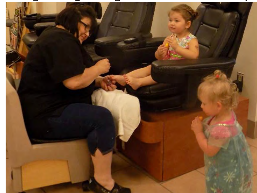
See great photos from a recent Fashion Show on page 6.

On April 7, 2017, the Cosmetology department at Grayson College held a Princess Day, which in-