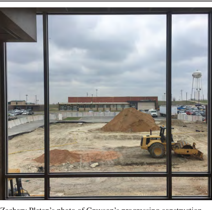
Zachary Pletan's photo of Grayson's progressing construction

Be sure to stop by and check out the variety, creativity and resourcefulness of the Art Appreciation students.