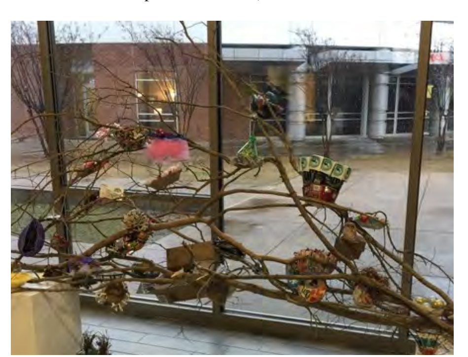
Recycled nest display

First, they were to decide on a purpose for their nest based on their needs and what is important to them. (As a human, we have more com-