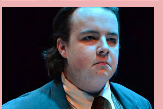
Cast members in costume for Scotland Road Production