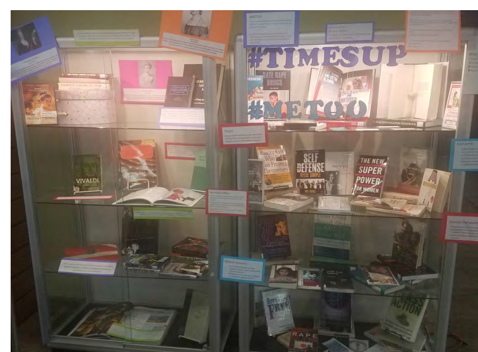
Women's History Month display in Grayson Library

advocates for legislation to punish companies that allow persistent harassment. It also encouraged women on the red carpet at the 75th Golden Globe Awards to wear black and speak out about sexual harassment and assault.