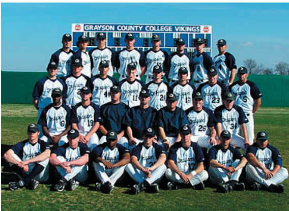
2006 Grayson Vikings Baseball Team