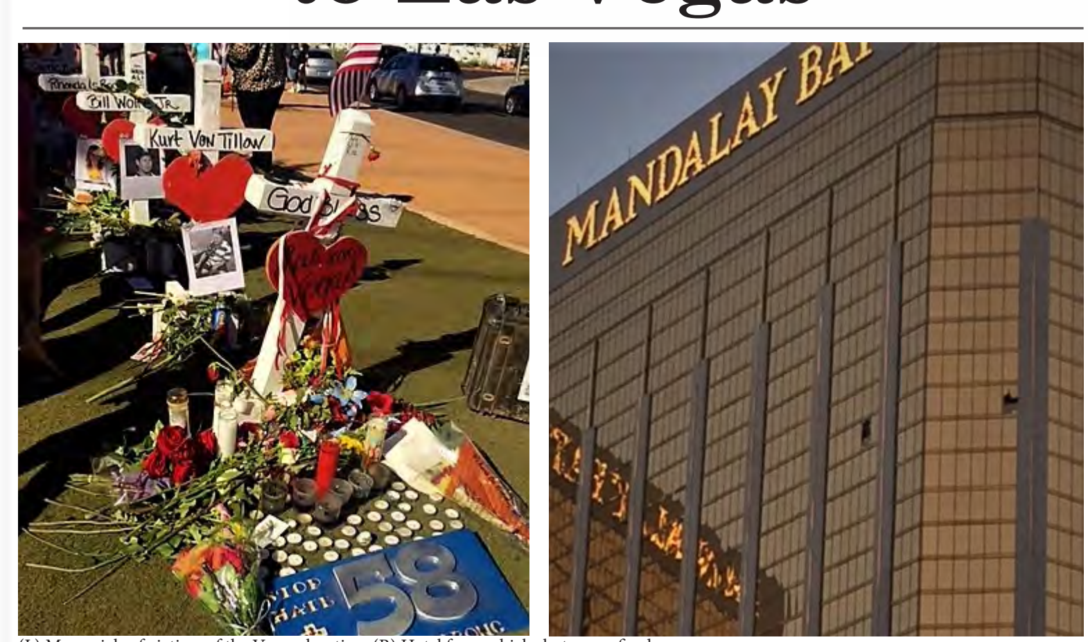
(L) Memorials of victims of the Vegas shooting. (R) Hotel from which shots were fired