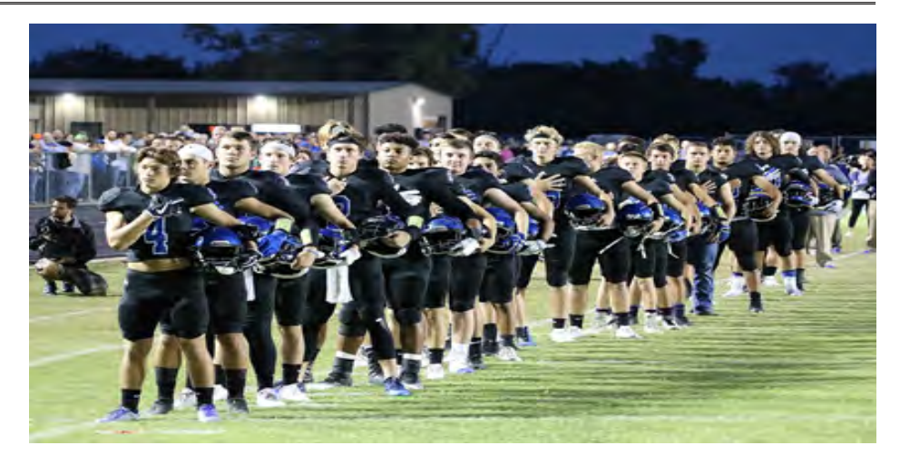
The Gunter Tiger football team during the National Anthem at Homecoming

The parade kicks off with the band, which walks the entire parade playing music, followed by the homecoming court, superintendent, football team, and then all the rest of the organizations. Anyone who ever plans on attend-