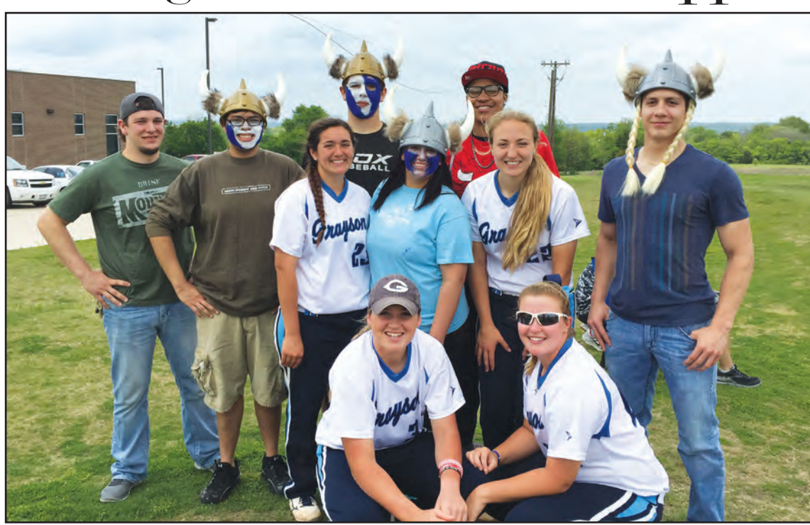
Some fans really know how to show love for their team. Taken between a double header.