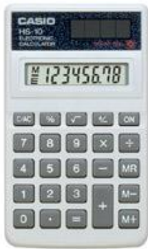
Four Function Approved

***** USE OF CALCULATORS Only four-function (+, -, x, /) non-programmable calculators (with square root, percent, +/-, and memory keys) are allowed on the THEA, THEA Quick Test, and COMPASS. No scientific, graphing, or business calculators are allowed.